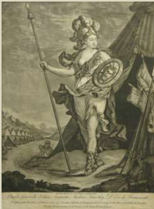
32. Charles, Genovesa, Louisa, Augusta, Andrew, Timothy, D'Eon de Beaumont.