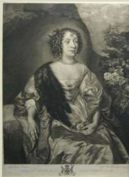
29. [Lady Philadelphia Wharton]

Mezzotint Robert Dunkarton after Sir Anthony Van Dyke Published Jan 1st, 1781 by John Boydell, Engraver in Cheapside, London. Image 387 x 304 mm, Plate 415 x 306, Sheet 447 x 328 mm Mounted